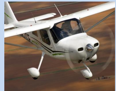
Cessna 162 Skycatcher

*3-piece chicken plate with coupon, 10 am-2 pm