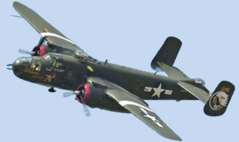
B-25J Mitchell, "Show Me"